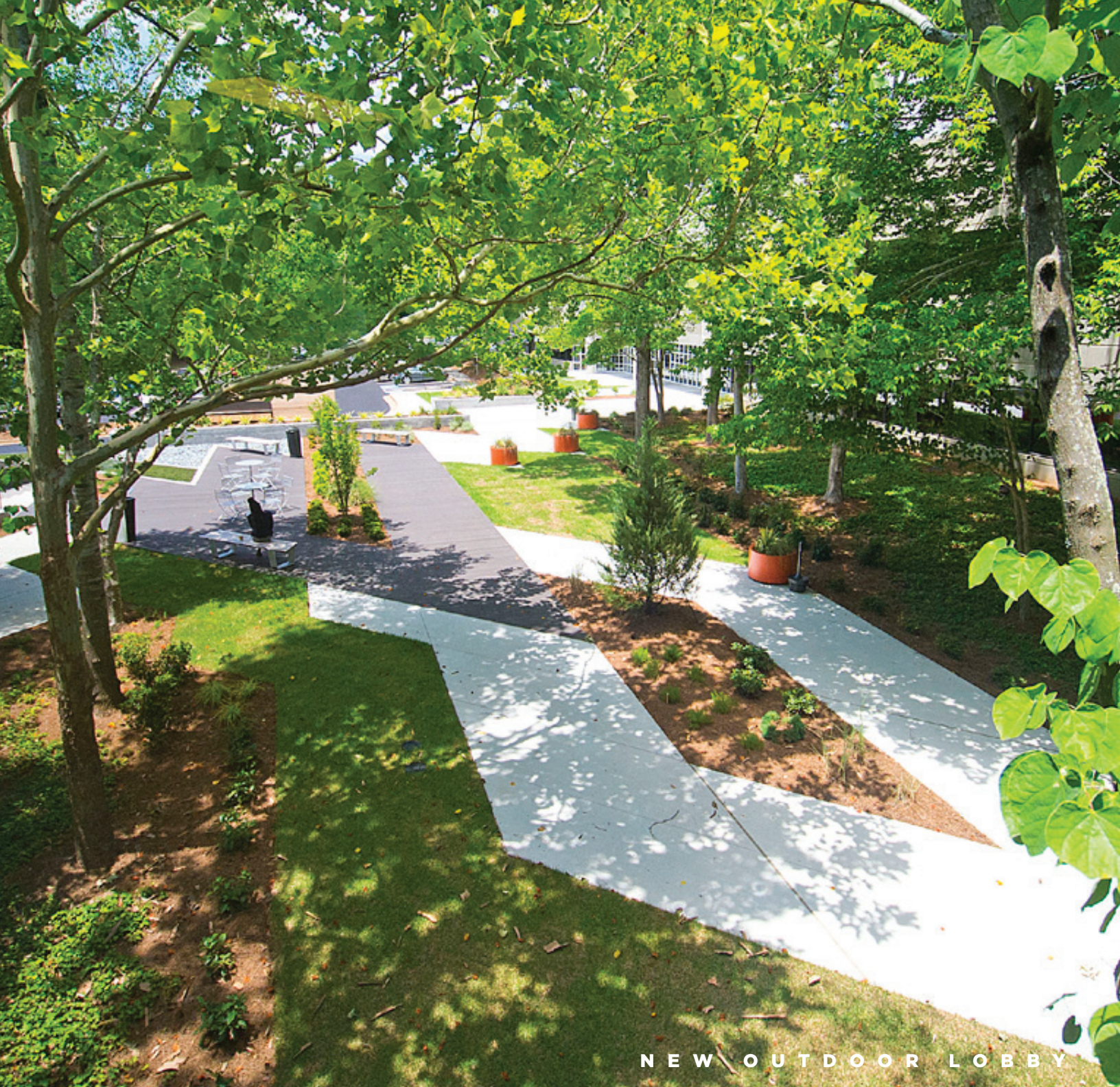
NEW OUTDOOR LOBBY